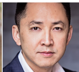
VIET THANH NGUYEN